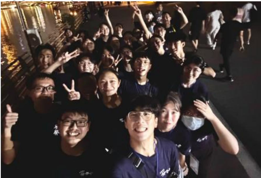
Class Photo near The Float @ Marina Bay