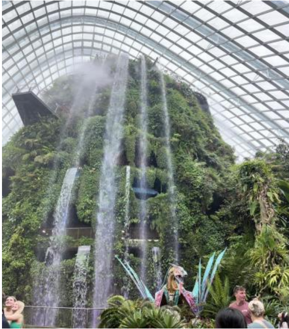
One of the tallest indoor waterfalls in the world, covered with plants from all over the world

We first visited the exhibition about Avatar. There was a large greenhouse garden with various species such as nasturtium and fuchsia. It was exciting to see several spectacular scenes which are similar to the movie scenes shown in Avatar.