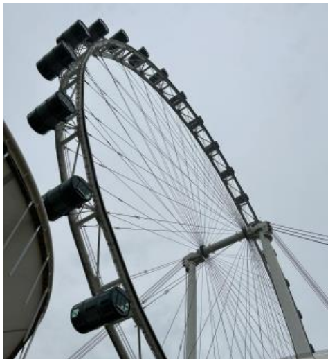
The magnificent Singapore Flyer

There is an AR interactive game that can detect our presence and convert us into Avatar characters in the photos. We scanned the QR codes on the screen to save photos for our memories. We are impressed by the AR technology and they brought us great memories and experiences.