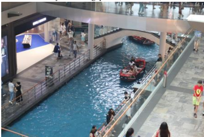
River in Marina Bay Sands Singapore

On the third day of our grand tour, we visited the Science Art Museum and the Merlion. WE passed through the Marina Bay Sands Singapore. There is an indoor river!