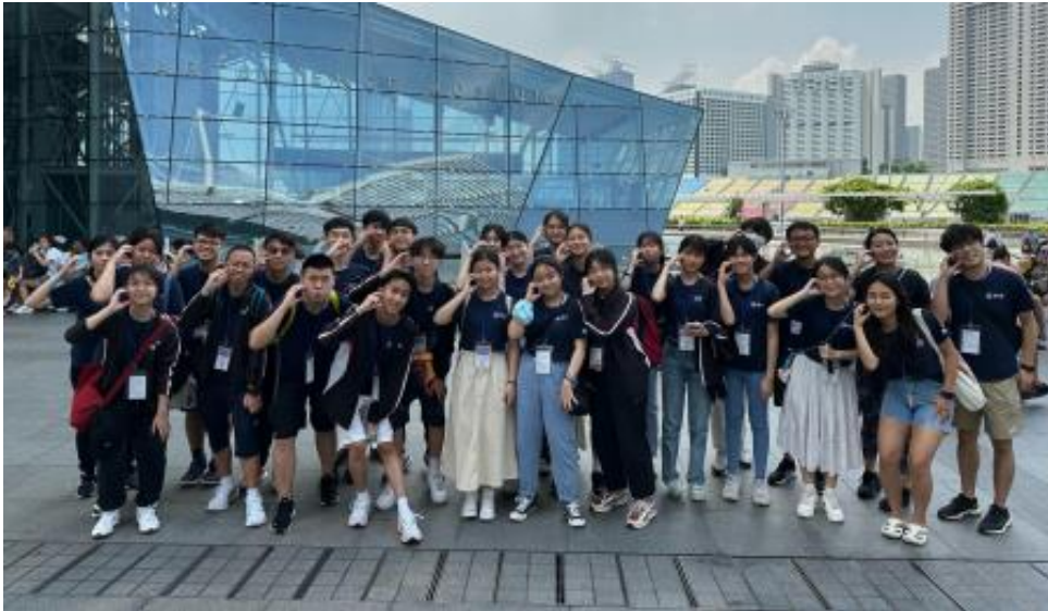
Class photo outside ArtScience Museum

Although the artwork in the Science Art Museum was beautiful and meaningful, the time spent at the Merlion was more unforgettable.