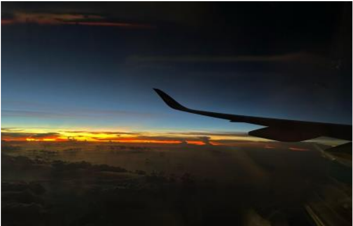
Last sunset in Singapore

After spending five days in Singapore, we developed a sense of team spirit and a better understanding of each other across the class. During the trip, we learned how to take care of each other and to consider others' points of view, which will be the most valuable lesson for 5C. As we approach the DSE, I hope that all of us can achieve great results and continue to support each other throughout our F5 year.