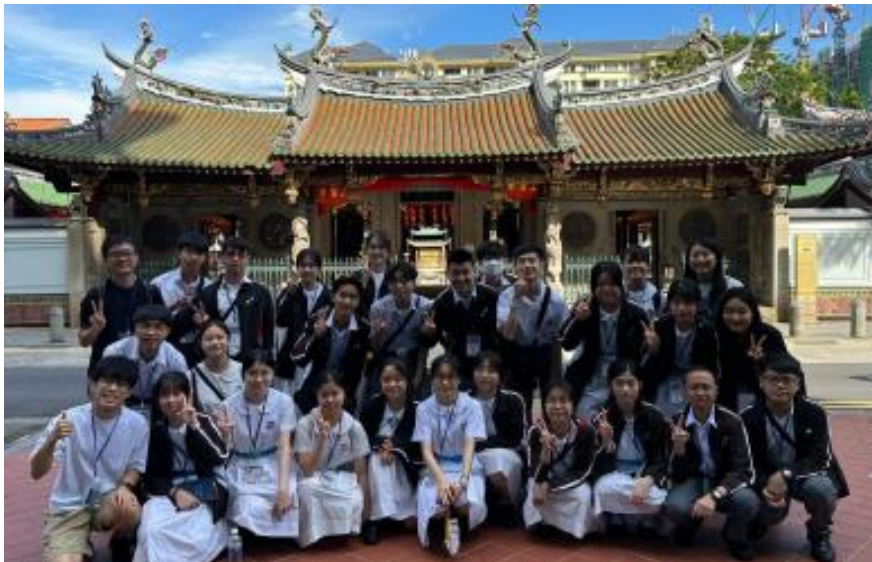
Class photo outside Mazu temple

On the last day of our grand tour, we were reluctant to leave Singapore and end our tour.